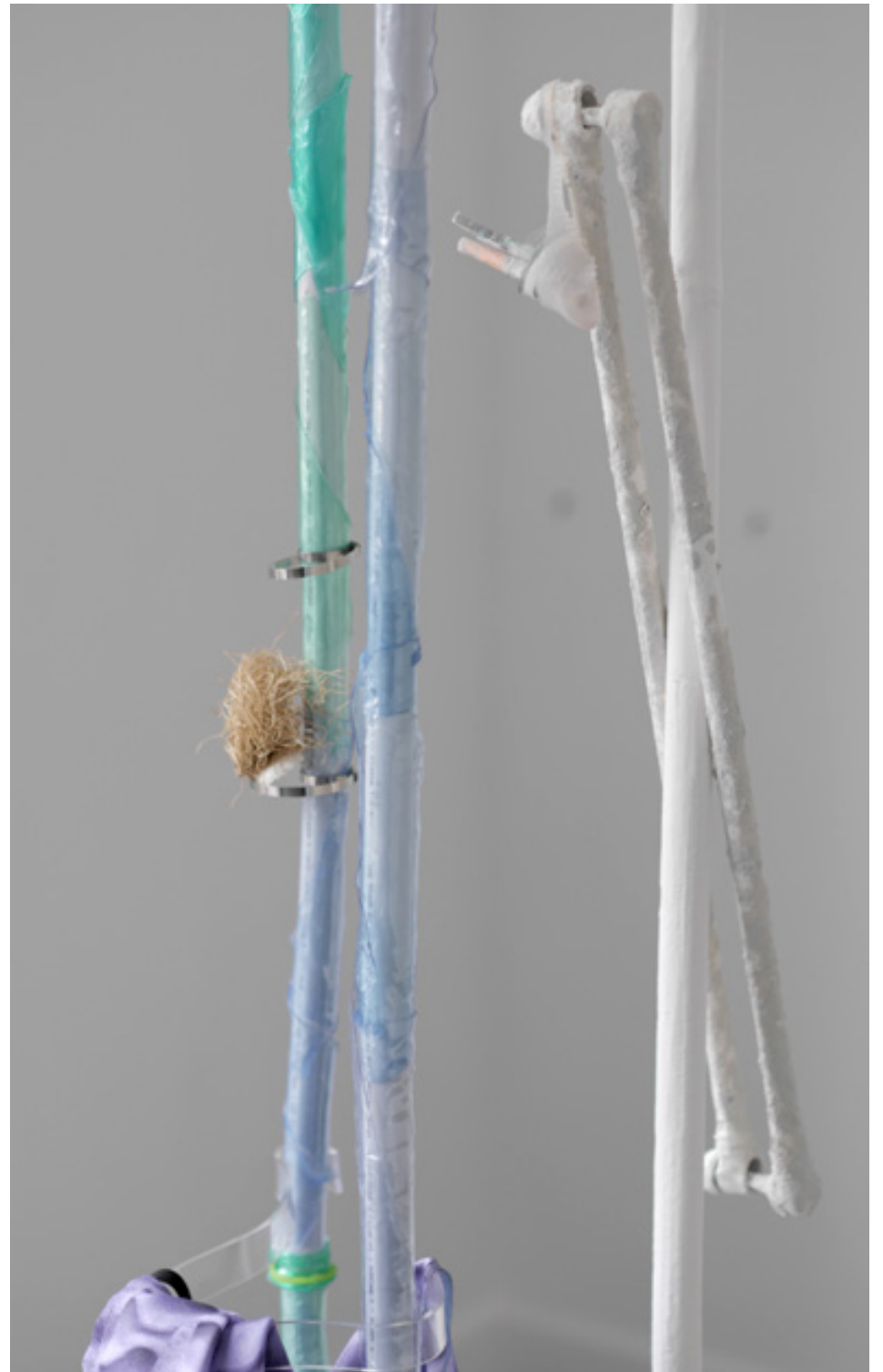
In The Vicinity Of Your Bones , 2019, (details)