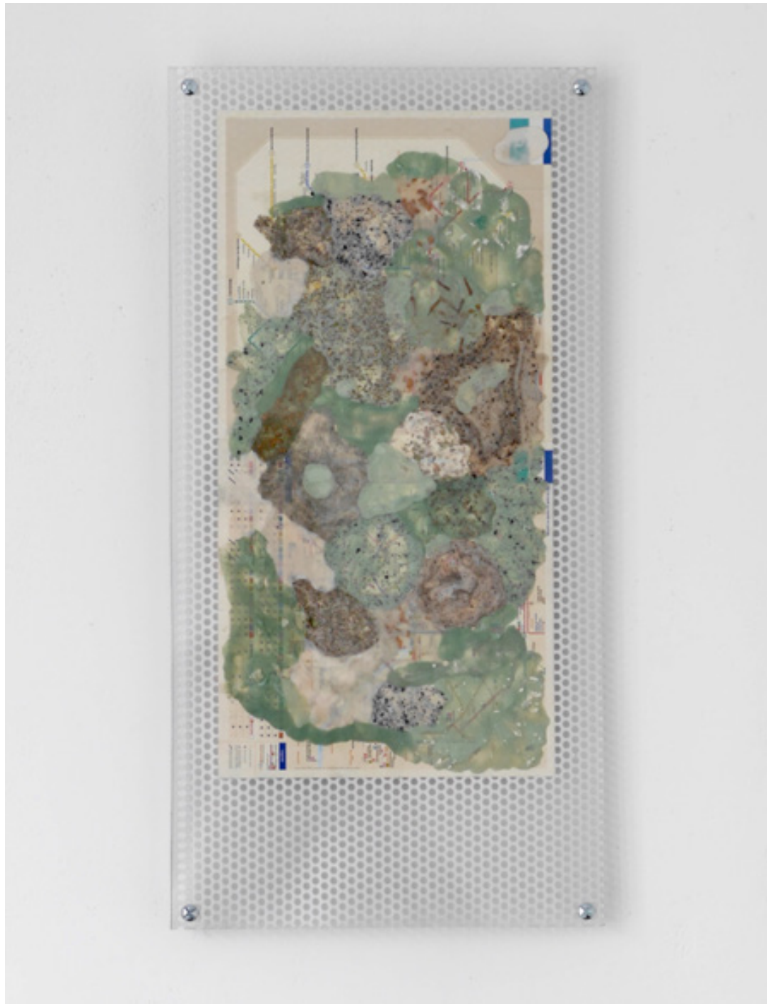
At Jaw Pace , 2019, chewing-gum, miscellaneous seeds and extracts, metro map, plexiglass, aluminium, bolts & nuts.