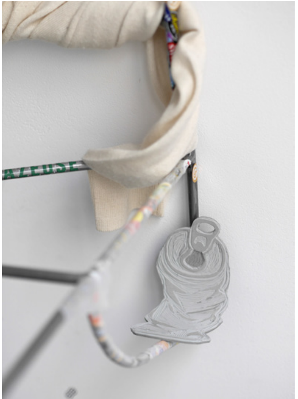
Fellow Passengers, 2019 (details)