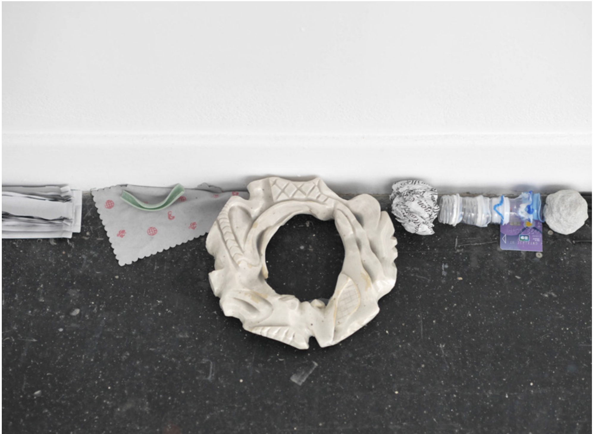
Caravan , 2019, site-specific installation at the miscellaneous modified, found and crafted elements. (detail)