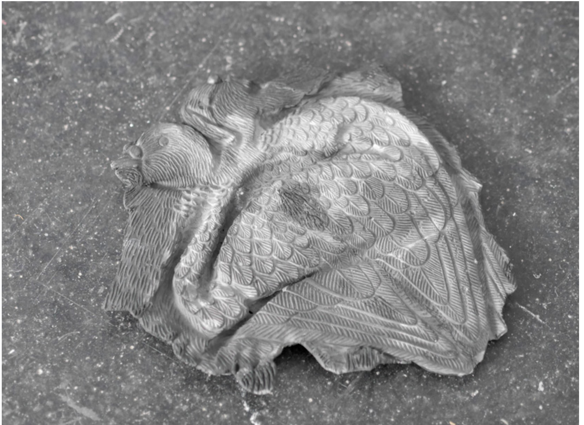
Untitled , 2019, plaster of Paris, ink