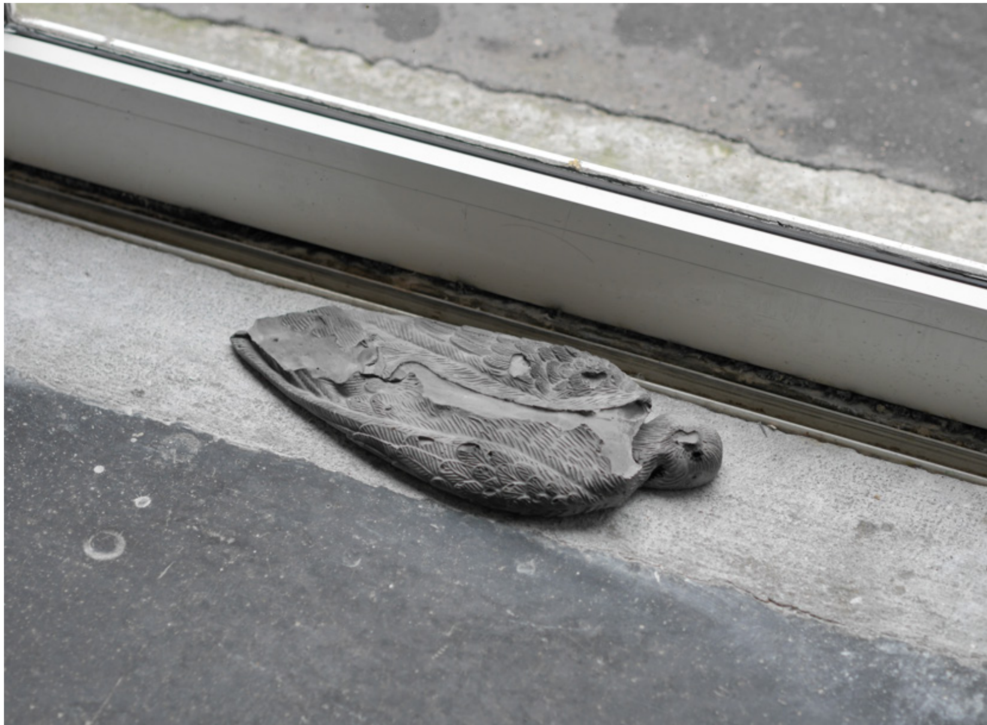
Untitled , 2019, plaster of Paris, ink