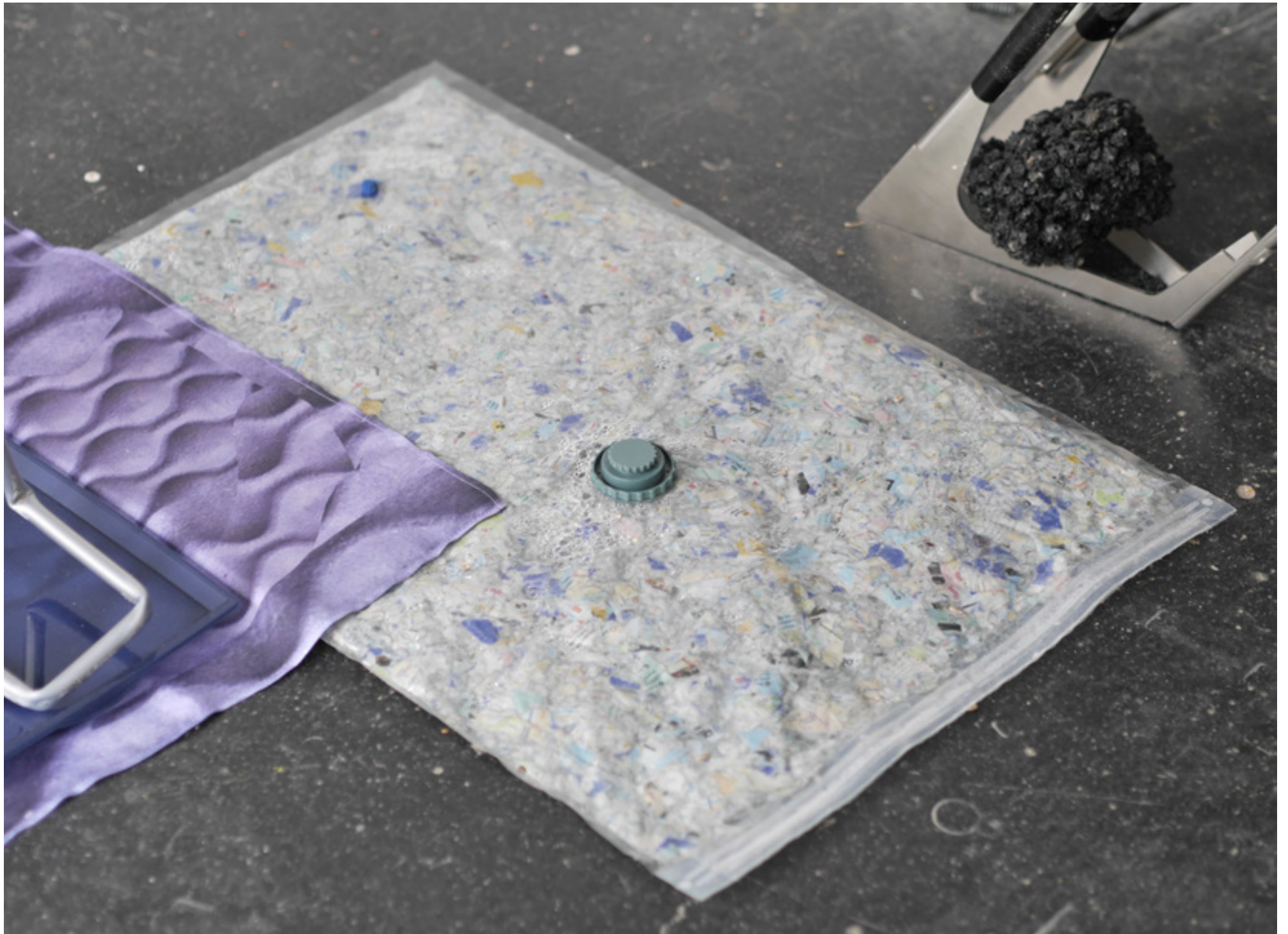
Packed Ways , 2019, metro map papier-mâché, vacuum bag