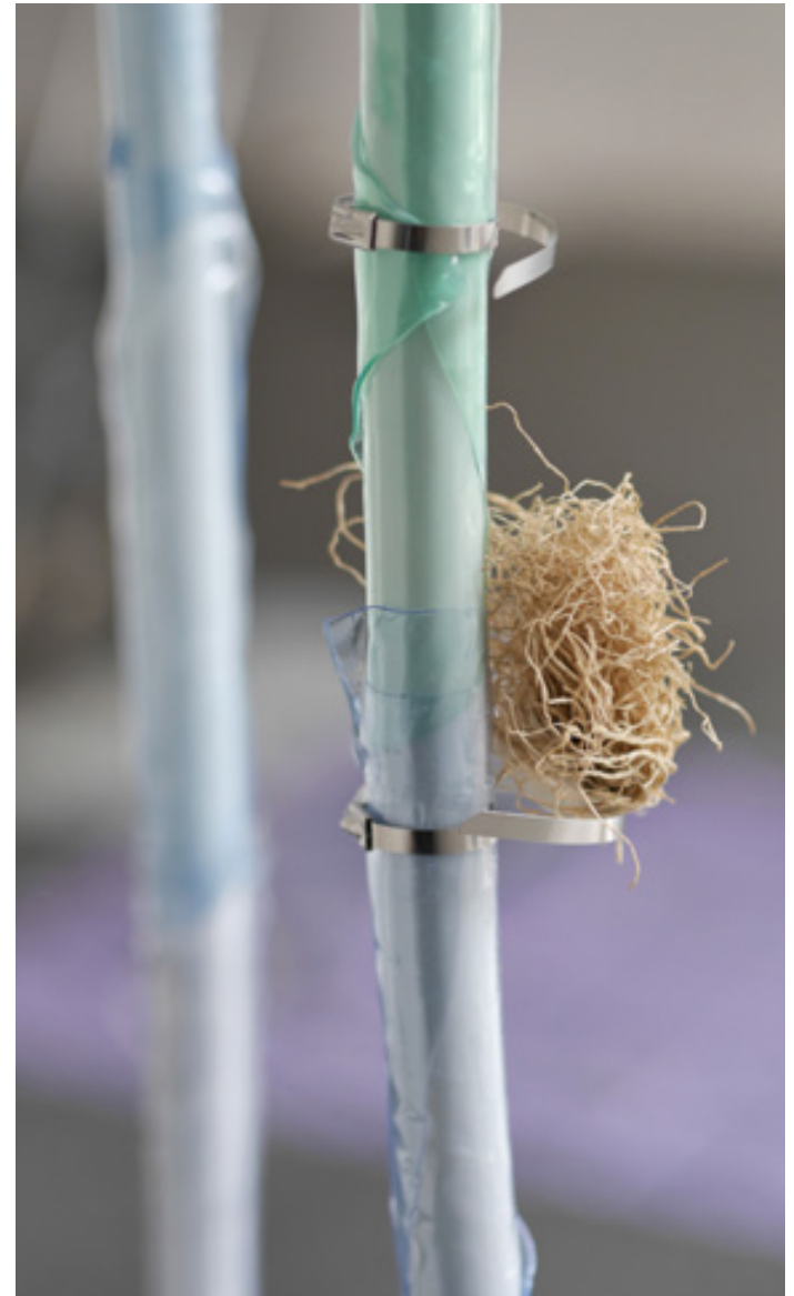
In The Vicinity Of Your Bones , 2019, (detail)