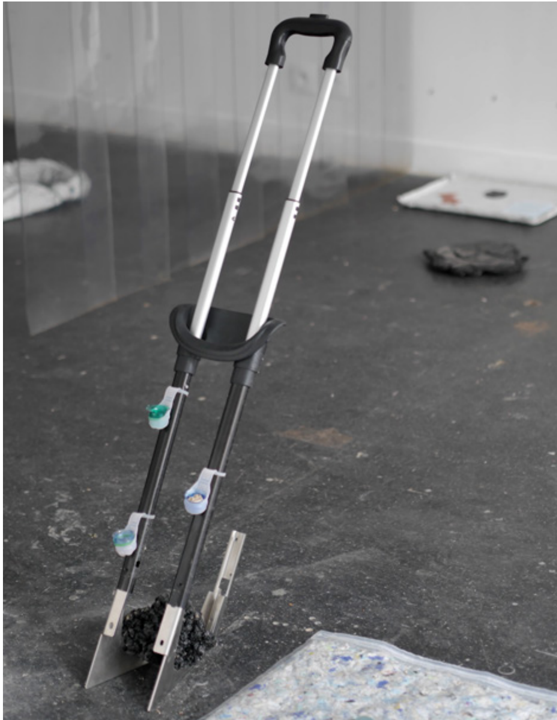
Frequent cryer , 2019, metal, suitcase handle, silicon, plastic, seeds, water, bitumen gravel