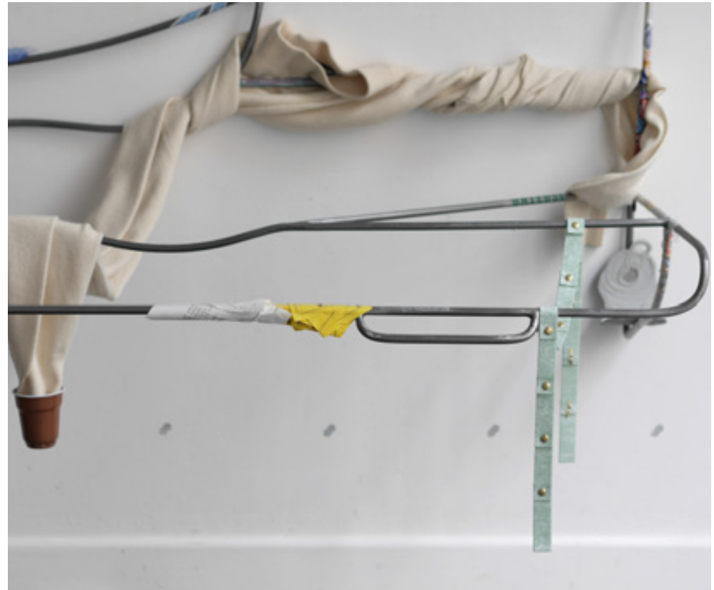
Fellow Passengers, 2019 (details)