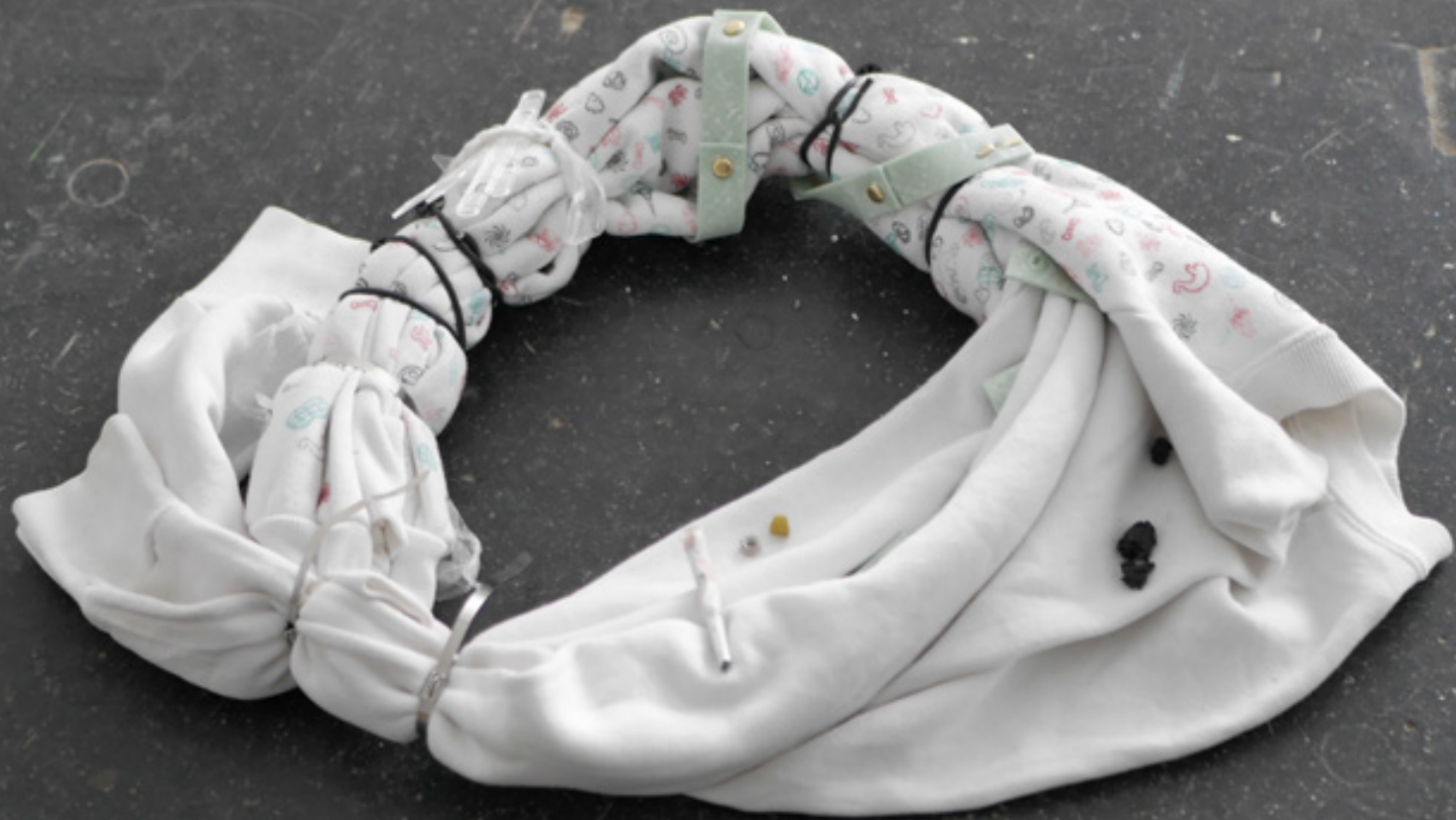
Nest , 2019, stamped college shirt, metal cable-tie, electric wires, chewing-gum, bitumen gravel, miscellaneous found elements