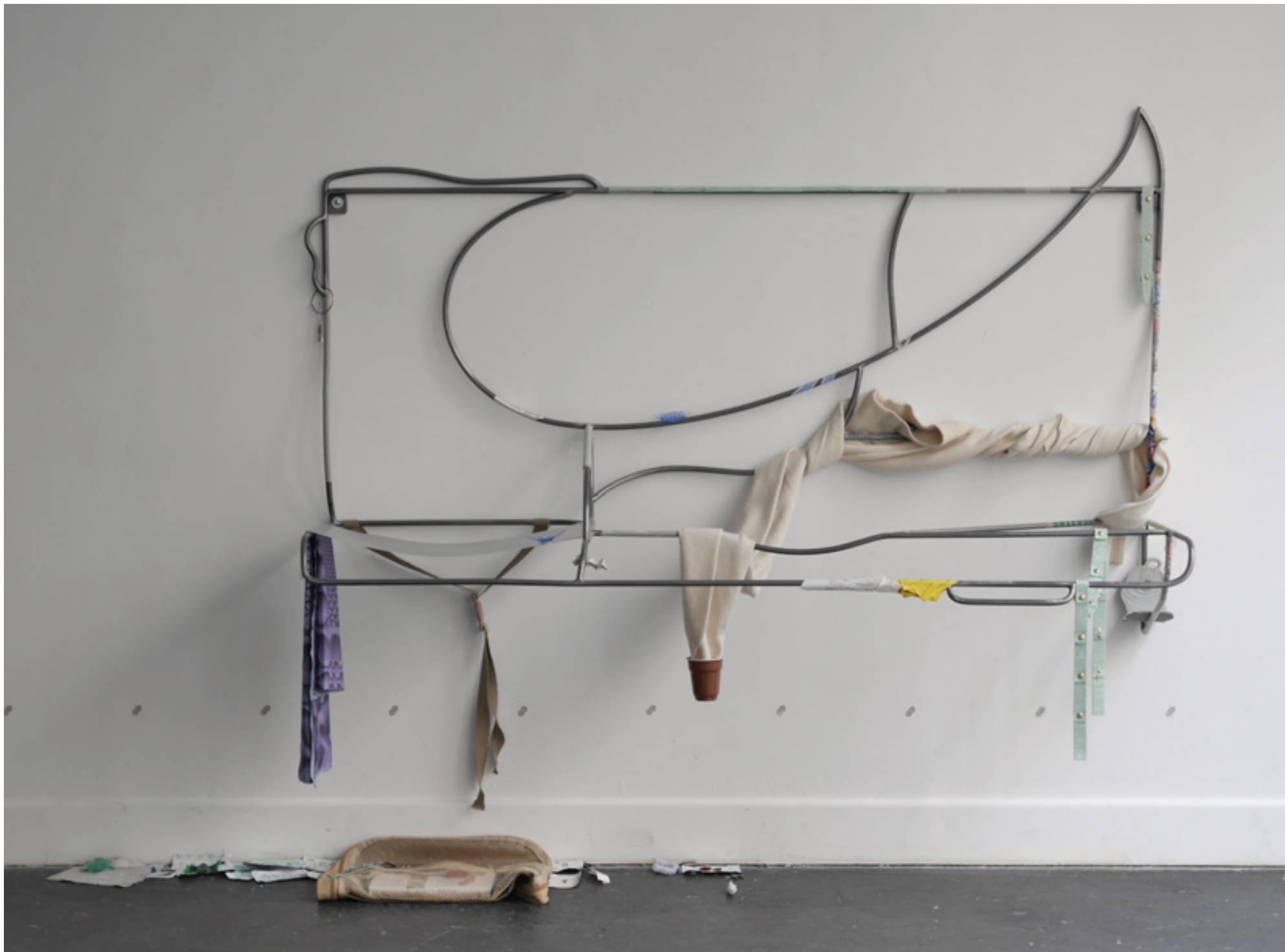
Fellow Passengers , 2019, steel, aluminium, silk, cloth, chewing gum, linoleum, fruit stickers, cigarette papers, flyers, miscellaneous objects.