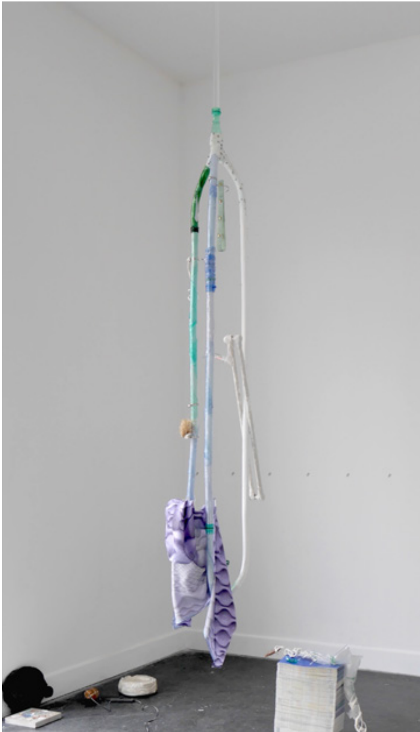
In The Vicinity Of Your Bones , 2019, tubes, plastic bottles, silicone, chewing-gum, found object, plaster bandages, papier-mâché, leek, plexiglass, digital printed silk scarf, miscellaneous objects.